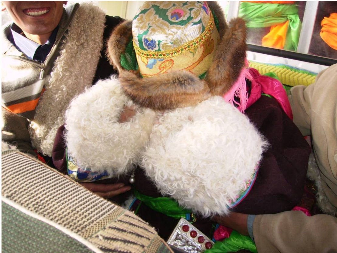
A local bride is accompanied by her brothers to the groom's family. It is a local custom to hide the bride's face.