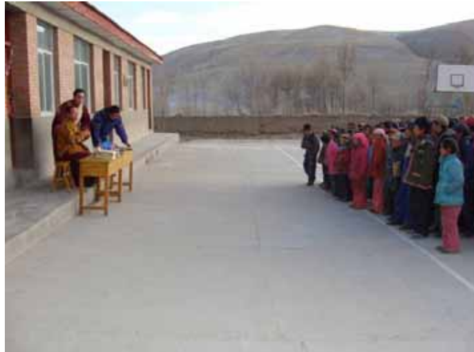
Top students receive awards after final results