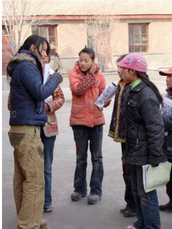
Students took oral English exams every afternoon