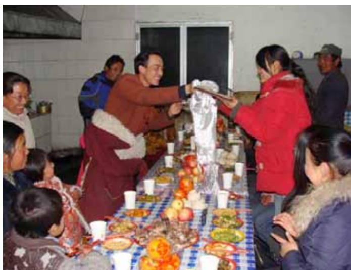
The headmaster gives teachers' payment at the end program's