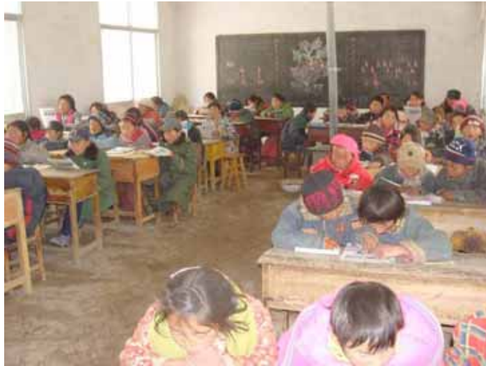
Elementary class students