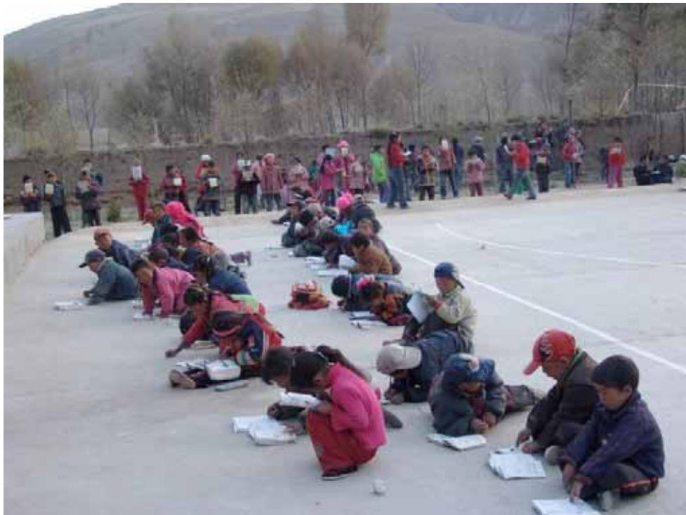
Students are reviewing their studies