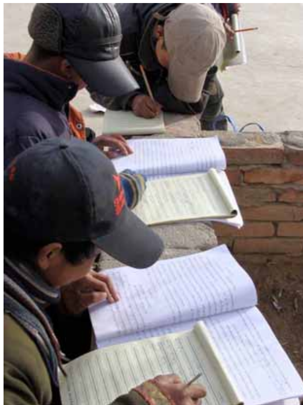
Students write homework outside