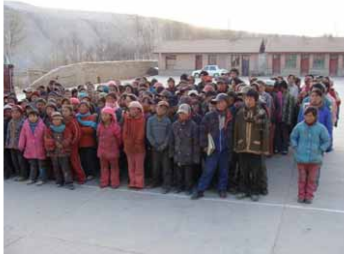
Students gather to a lecture given by the Tibetan teacher