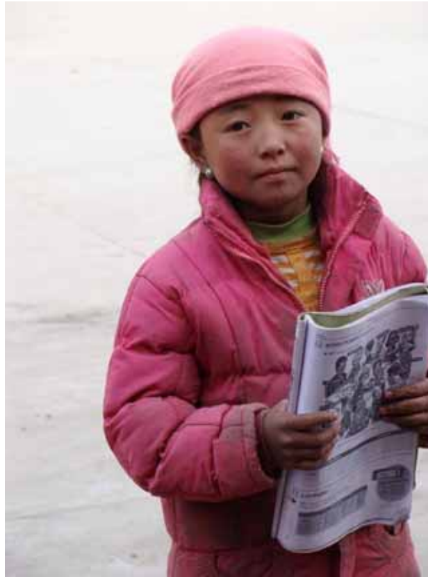
A student memorizes English words