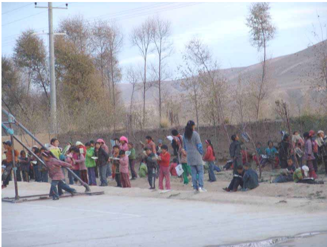
A teacher observes the students