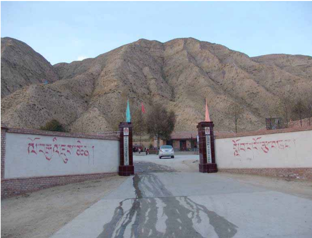
The gate of Bon skor Tibetan Primary School