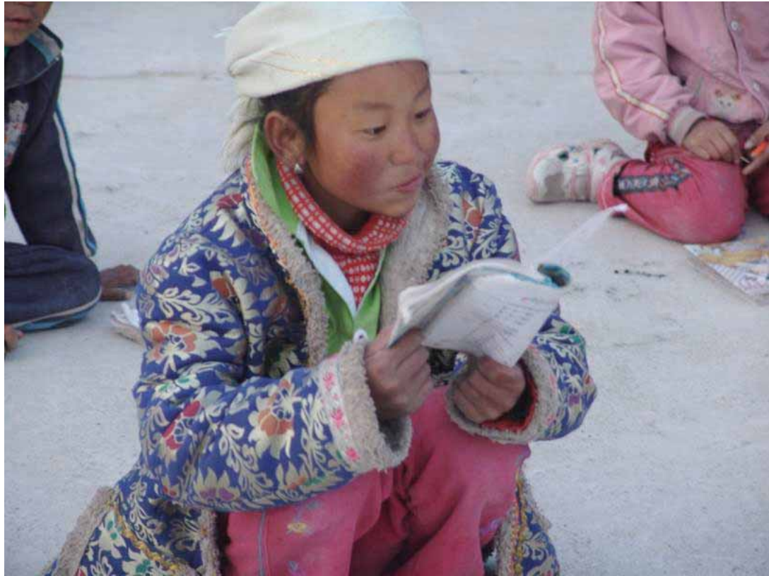
A student reads