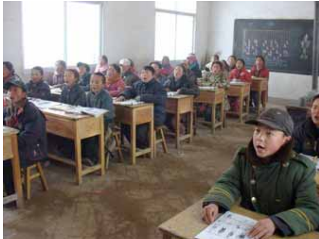
Class two students