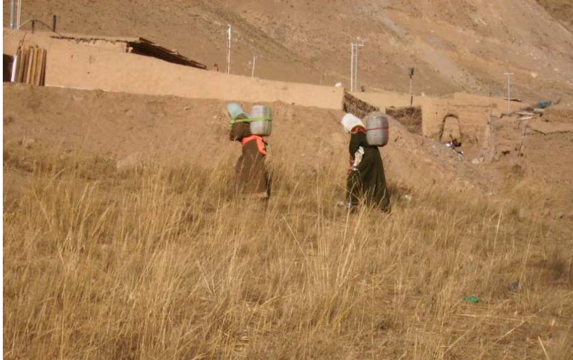
Local women carry water from the neighbor village