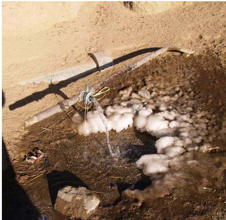
The water tap 9 km from the local village